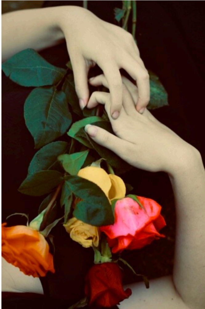
Lulu Roche, Untitled #2 , From the Ophelia series, 2020, Ink jet print, 20 x 16 inches